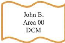
Sample Name tag

FIRST NAME: _____ LAST NAME: _____ AREA#: _____ ADDRESS: _____ NAME ON BADGE: _____ CITY: _____ STATE: _____ ZIP: _____ EMAIL: _____ (required for confirmation) PHONE#: _____